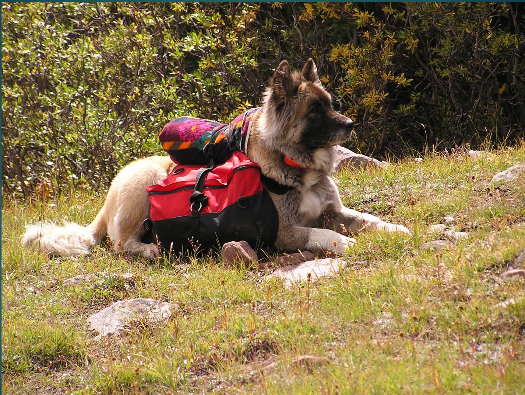
Kiesha Working in the Uinta Wilderness