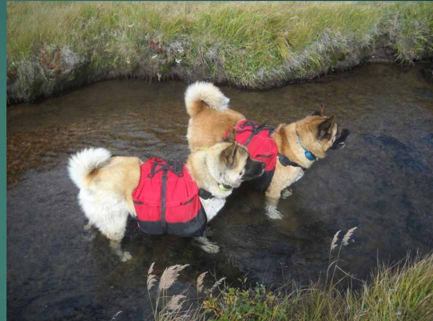
Mobi and Uno at work in Uintas - cooling their feet on a long hike