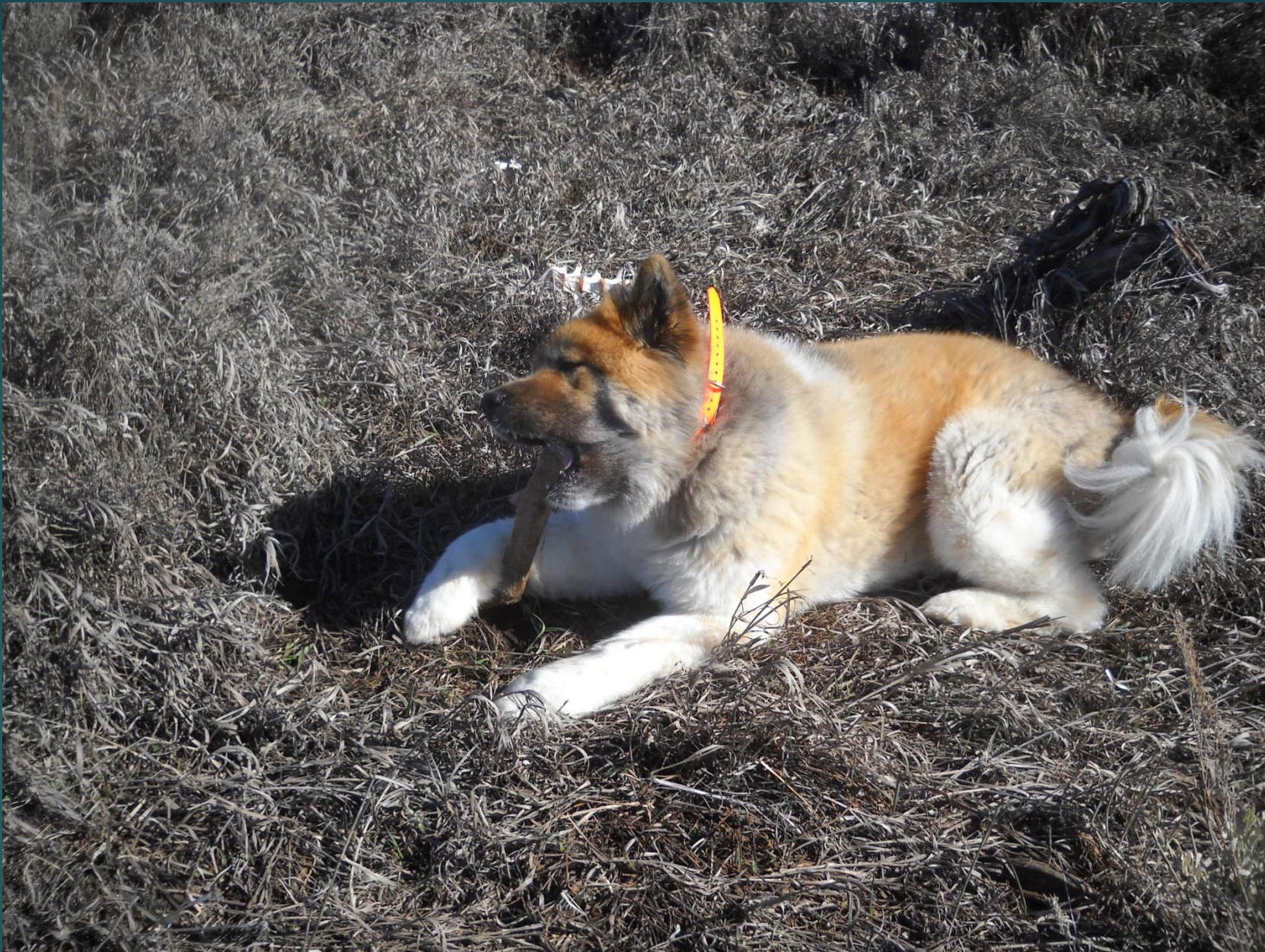
Chia gnawing deer leg after winter kill at the Preserve