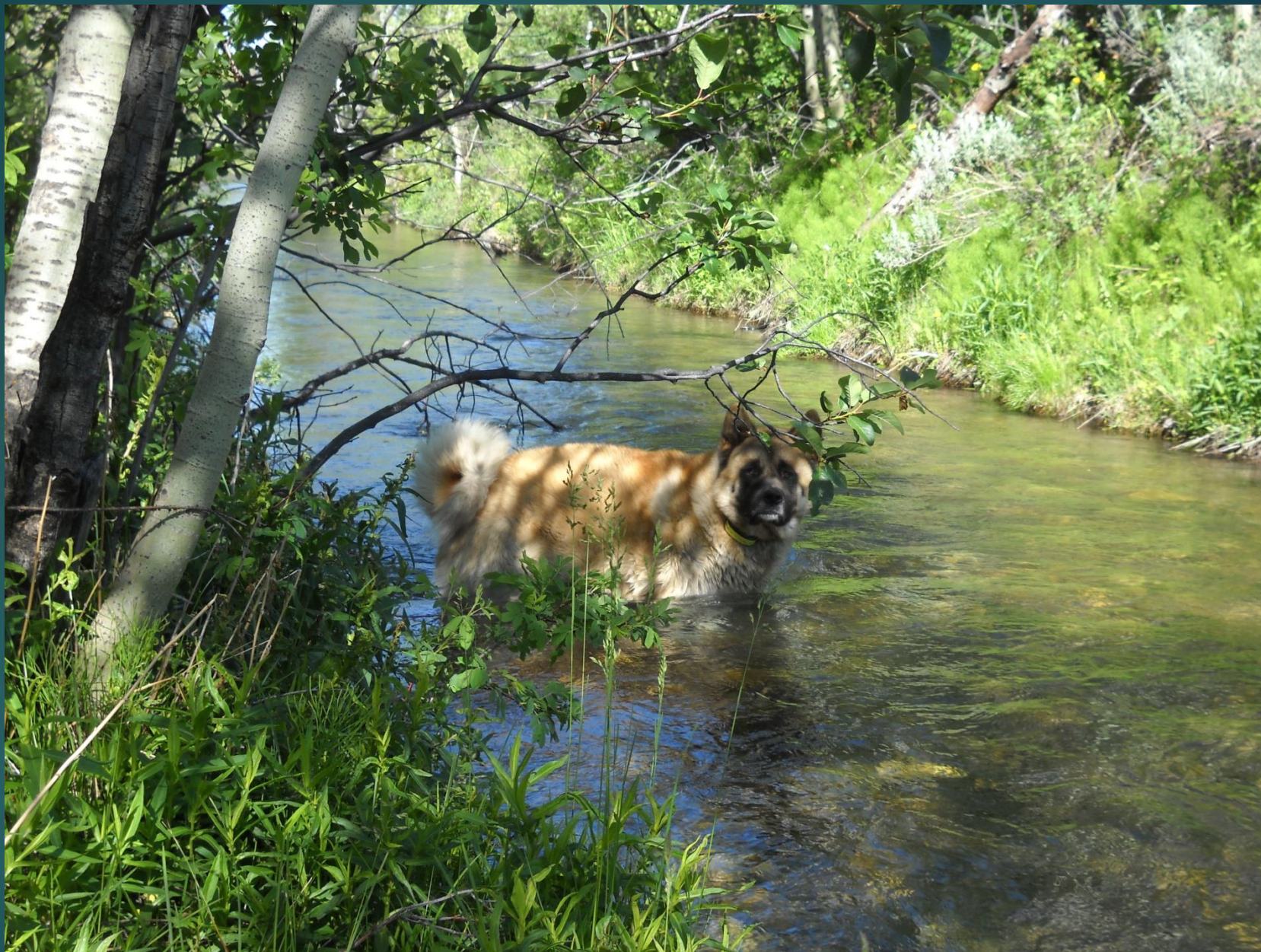
Uno enjoying canal on Kiesha's Preserve