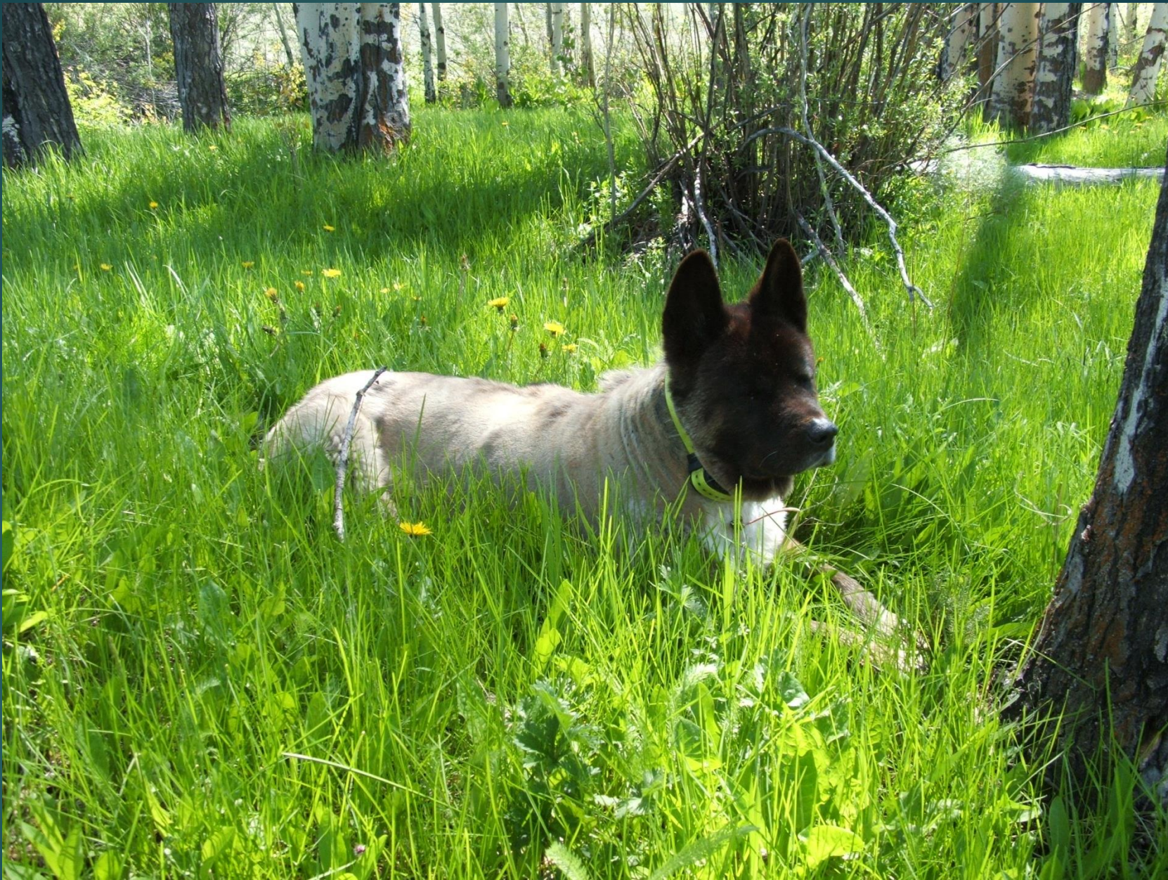
Toqi enjoys recovering riparian and aspen on Sleight Creek