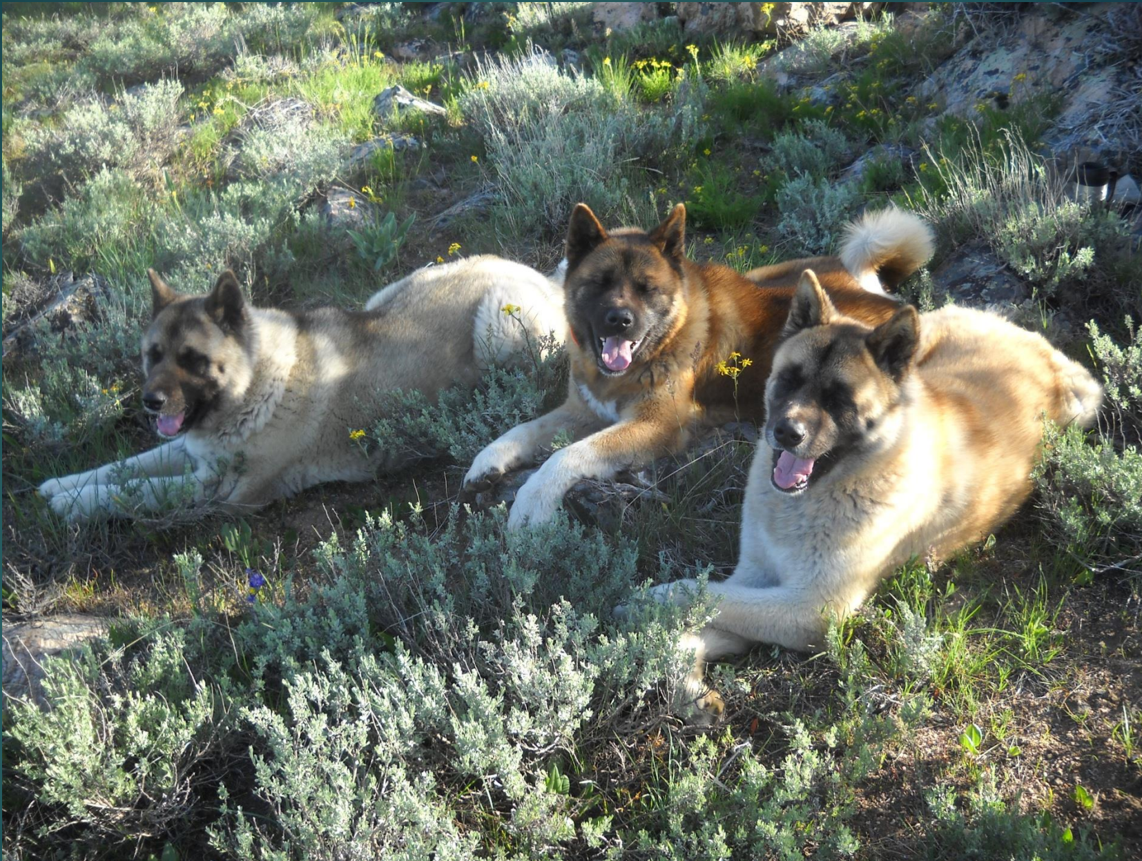
Ita, Luna and Uno take a break on a hike at the Preserve