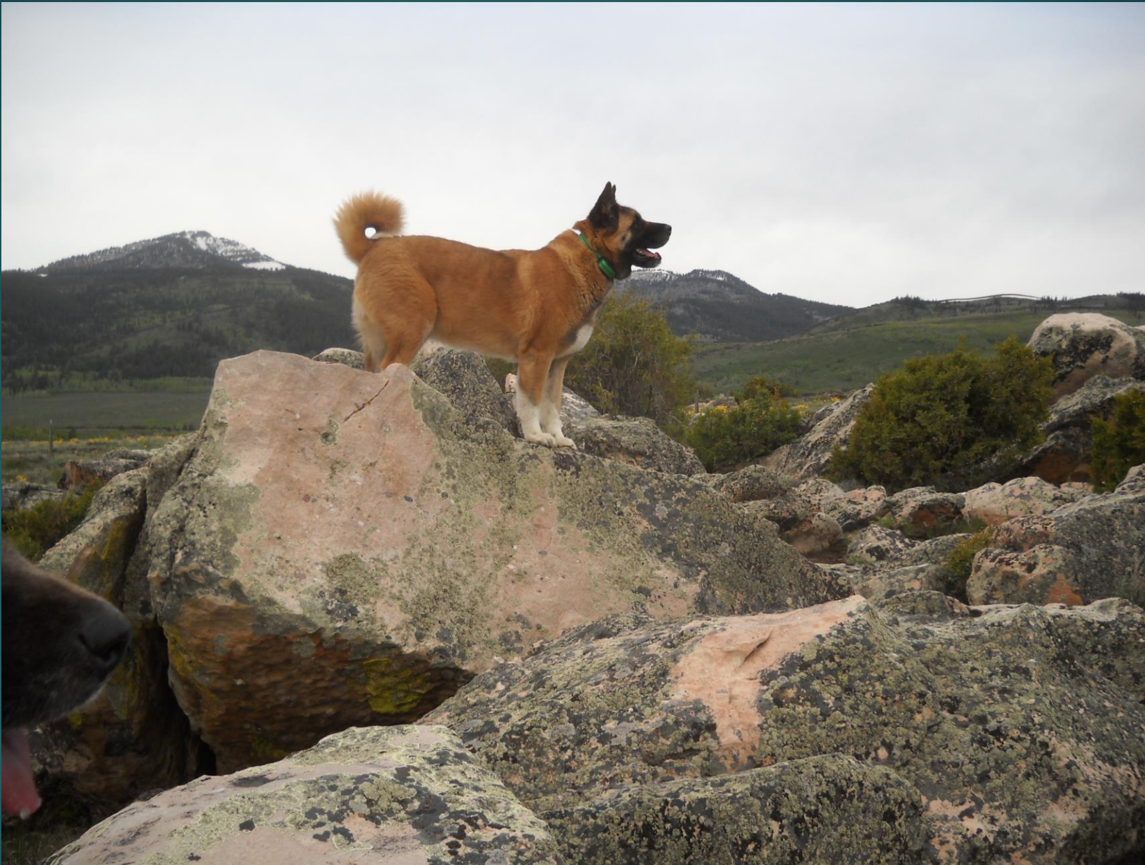
Mobi enjoying the View on the Paris Fault on Kiesha's Preserve