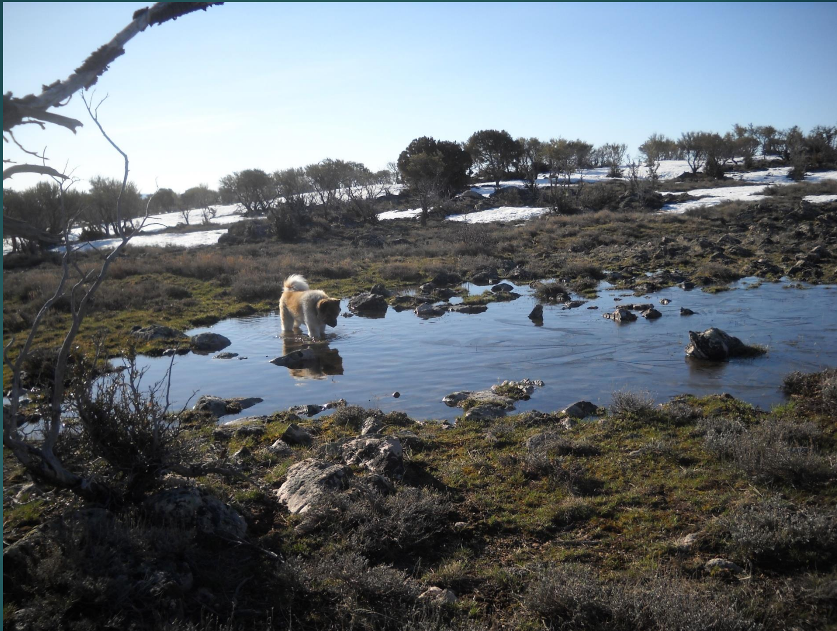
Chia wading in snowmelt pool a source of water for wildlife in uplands on the Preserve